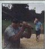
The Damnders of Summer